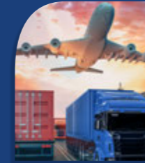
Transport, Logistics & Retail