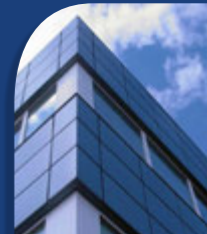
Aluminum & Cladding