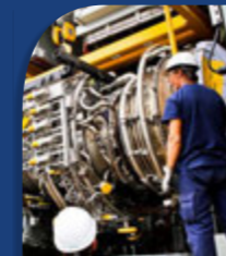
Oil & Gas/Refinery/ Petrochemical