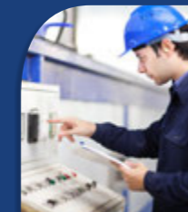
MEP (Mechanical, Electrical & Plumbing)