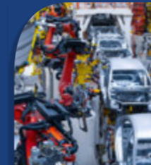
Production / Manufacturing