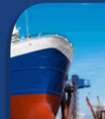
Ship Repair & Maintenance