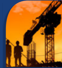
Construction & Infrastructure

From an SME in India to a global MNC giant, Manpower Recruitment needs come in all sizes. We at Continental Holdings Inc, the management works in its own unique ways to deliver quality result on time.